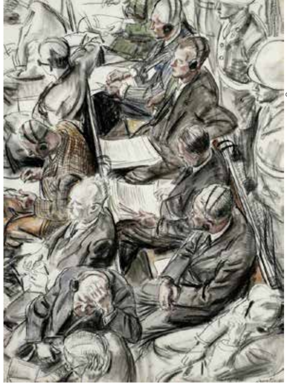
Prisoners in the Dock at Nuremberg Trials, 2 (1946), by Laura Knight

Building on the education aspect of its digital work, its 'arts and mental health' arm is aimed at older people, and presents programmes and tutorials for residents in care homes and people with dementia, all of which is available