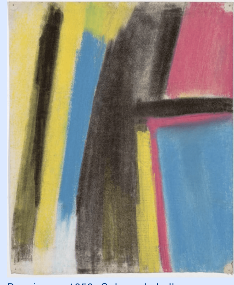
Drawing, c. 1953. Coloured chalk on paper ©The Gustav Metzger Foundation