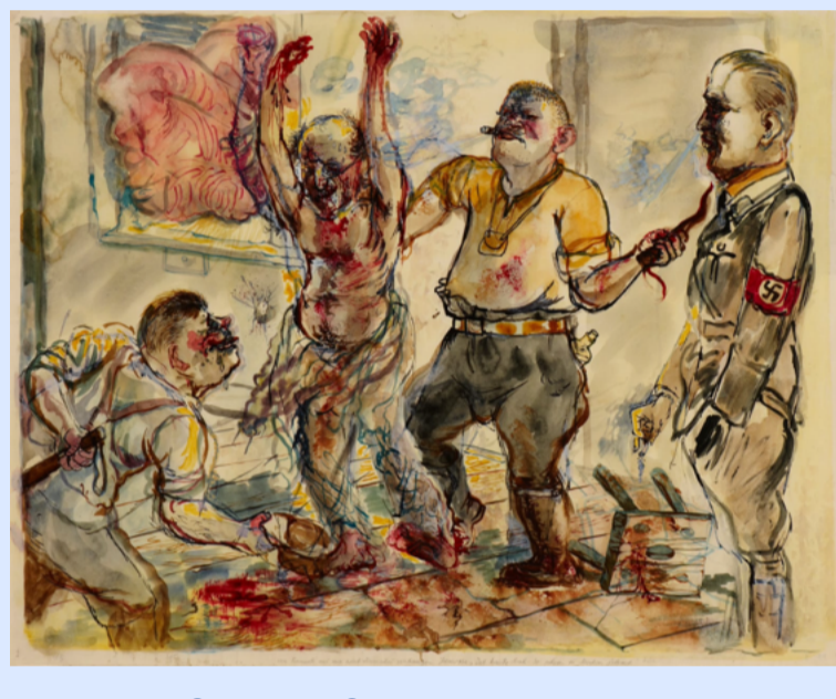
George Grosz, Interrogation , 1938 © George Grosz estate

This seminal work by George Grosz was seen at Maastricht in March 2010 and purchased soon after with the invaluable support of the Art Fund and many supporters.